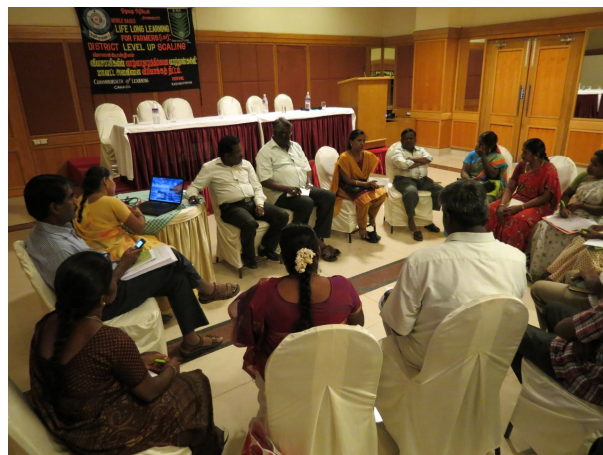
Discussion with L3F Stakeholders

VIDIYAL assisted to prepare the NGO Partners Business proposals and to submit their members credit applications to all the Banks.