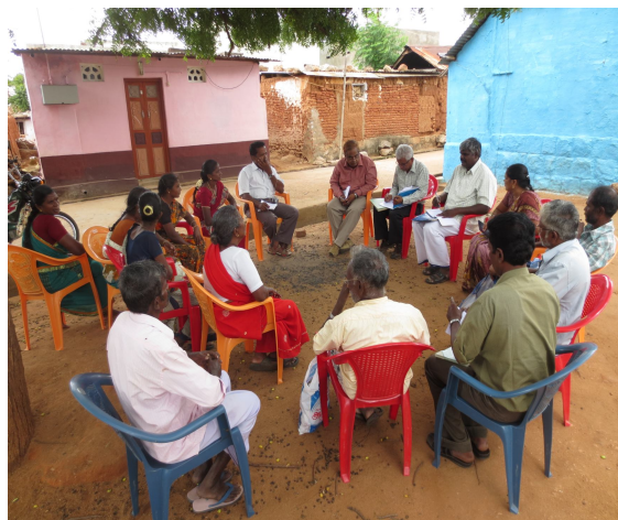
Review of VWC by NABARD Officials

From 2005- 2010 executed watershed activities at T.Meenakshipuram with the Farmers participation. Vidiyal has developed Village watershed Committee (VWC), maintenance Committee for watershed structures, Livelihood forum for the Landless groups and Community Milk collection Centre maintained by the User groups. To support the farmers Vidiyal has got loan of Rs.10,00,000/- under water Plus activities in 2012. The loan was distributed through the VWC for 53 members for their microenterprise activities such as Goat and Milch animal rearing.